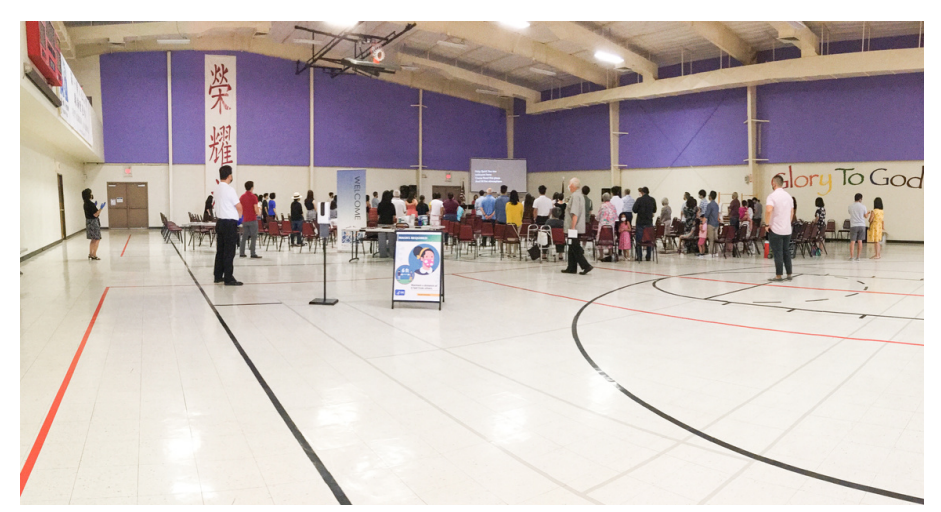
(Church Opening on June 6th)